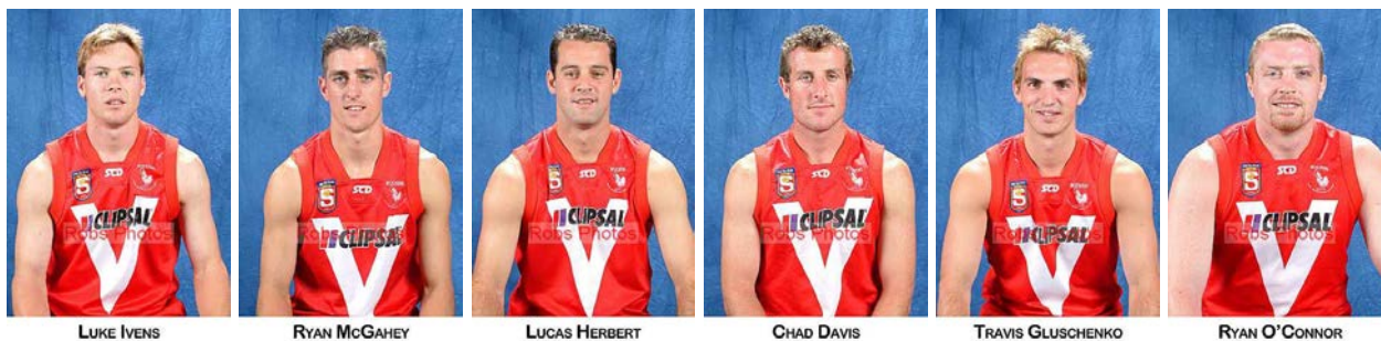
Players who had a role in North's long-awaited victory

It would be nice to say the win turned the club's season around and we stormed into the finals, but alas the win would prove the only time for the season the club would have their song played after the final siren. By the end of 2003 North had more draws (two) than wins and even the coach didn't make the final minor round. But at least for an afternoon in May 2003 it was North's time to shine.