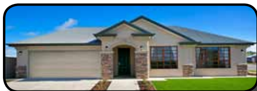
181 Inwood Court, Strathalbyn - Pipers Crest

Lease Back Term: 1 year (6+6+6+6 option)