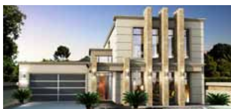
MONACO - PALAIS NOUVEAU

The Stellar World of Homes is our latest design innovation, bringing influences from around the world in a range of interchangeable facades for some of our most popular designs. Our designers have searched the globe to capture the essence of styling, from the romance of a French Provincial frontage to the gracious lines of quintessential New Hampshire styling.