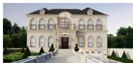
FRENCH - LE BEAU MAISON

The Stellar World of Homes is our latest design innovation, bringing influences from around the world in a range of interchangeable facades for some of our most popular designs. Our designers have searched the globe to capture the essence of styling, from the romance of a French Provincial frontage to the gracious lines of quintessential New Hampshire styling.