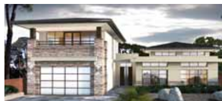
CHINESE - JIA MEI