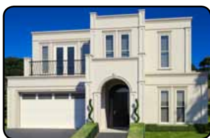
Easton Drive, Gawler East (Springwood)