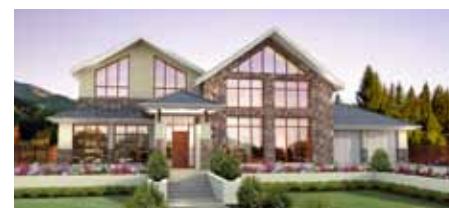
SWISS - GRANDE CHATEAU