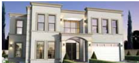
BRITISH - ASTON ABBEY

The Stellar World of Homes provides a virtual 'wardrobe' of looks for your new home. All you have to do now is decide which part of the world to take your inspiration from.