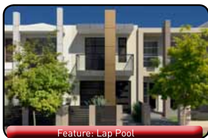
Feature: Lap Pool