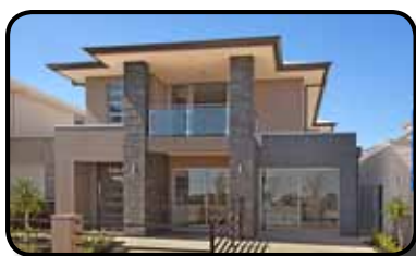
13 The Strand, Northgate - Lightsview

EXCLUSIVE DISPLAY HOMES FOR SALE LEASE BACK OPPORTUNITIES AVAILABLE