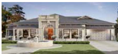
AUSTRALIAN - MAIDAN STONE LODGE